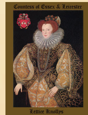
Lettice Knollys Countess of Essex & Leicester Lady-in-Waiting to Elizabeth I Queen of England