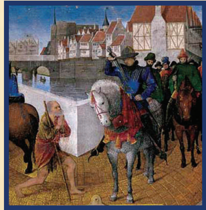
St Martins of Tours cutting his coat in half and sharing it with a freezing beggar.

I leave you with this food for thought: Northern Europeans ate so much garlic that when Crusaders passed through Constantinople the Turkish natives held their noses, complaining of the prevalent stench!