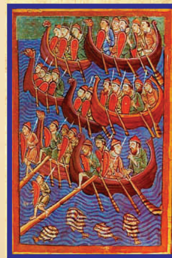
Vikings walking the oars The movie, The Vikings , with Kirk Douglas has a fantastic scene of the men walking the oars.