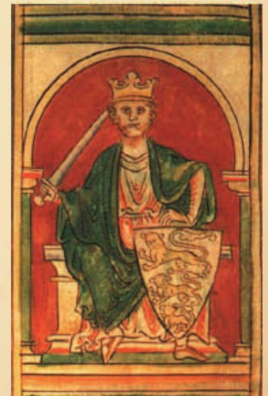
Richard the Lionheart King of England

Richard and his knights journeyed to Chalus in spring 1199 to claim a horde of Roman treasure that was discovered by a peasant when ploughing his field. While directing a siege of the castle on the 26th of March, a crossbow was fired by an archer from the battlements hitting Richard in his left shoulder. In an attempt to remove the bolt, the shaft broke leaving the iron head in Richard's flesh. An unskilled surgeon succeeded in removing the arrow head but the wound had been compromised and gangrene set in. Upon the fall of the castle Richard had the archer brought to him. Knowing that death was a surety, Richard declared to the archer "Live on, and by my bounty behold the light of day." He was even given a hundred