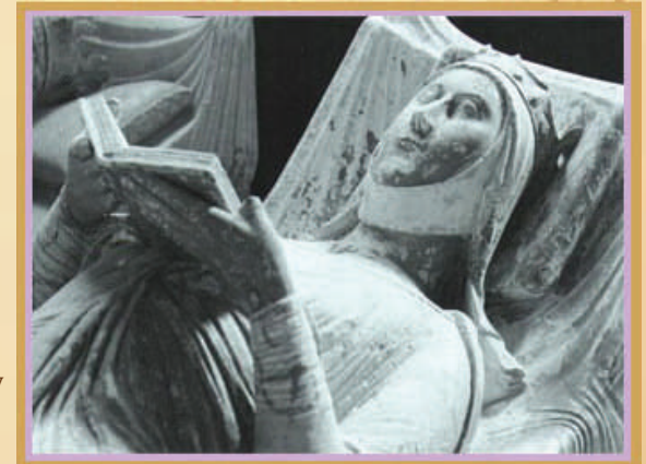
Eleanor of Aquitaine buried at Fontevrault in 1204